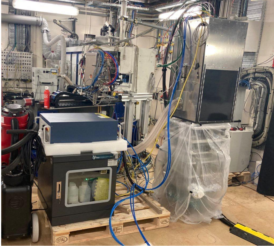
Figure 1. Equipment set-up at ID19

Report: We successfully commissioned the in situ Directed Energy Deposition process replicator onto ID19: