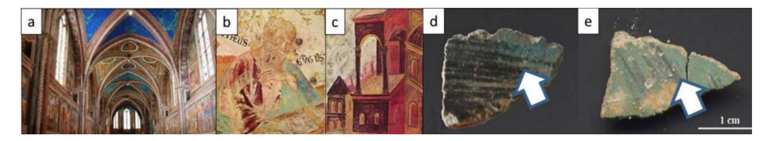
Fig. 1 (a) Assisi Cathedral (b, c) details of mural paintings damaged during the earthquake (d) fragment showing a strong amount of blackening (e) fragment showing a slight amount of blackening.

The aim of this research is to better understand the mechanism behind the oxidation of lead white and which factors influence it. For this part of the experiment a series of model samples have been analyzed which were made by exposing lead white to different conditions such as pH and oxidizing agents.