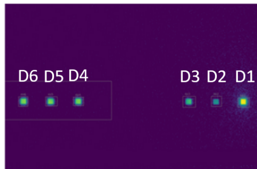
Figure 2 – experimental measurement of the six outputs with the EIGER camera

We used the reciprocal lattice vector normal to the silicon (440) atomic planes in transmission geometry and the interferometer was aligned accordingly. We started without the object and the result of the measurement is shown in Fig. 2. While port D2 seems to be darker than D5 the observation did not change when we mounted. After a few tests we realized that the intensity at the output port that corresponds to the arm without the sample is much higher than the one that propagates through the sample. Thus, the difference in the intensity between the two ports is due to the difference in the reflection and transmission coefficients. While this ratio significantly reduces the modulation, in principle the interference still exists. However, we were not able to measure any interference effect.