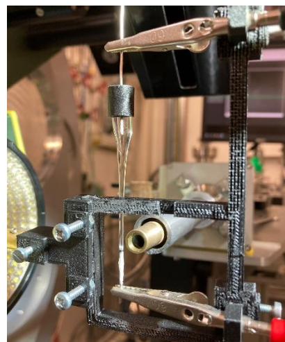
Fig. 1. Electrochemical reactor

The electrochemical transformation of graphite into graphite oxide was successfully performed in sulfuric acid electrolyte. Galvanostatic curve shows that sample was sensitive to X-ray beam (Fig. 2 – white curve).