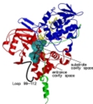
Figure 1. Overall three-dimensional structure of human MAO B monomeric unit in complex with 1,4-diphenyl-2-butene. The FAD-binding is in blue, the substrate-binding domain in red, and the C-terminal membrane binding region in green. The inhibitor binds in a cavity (shown as a cyan surface) which results from the fusion of the entrance and substrate cavities.