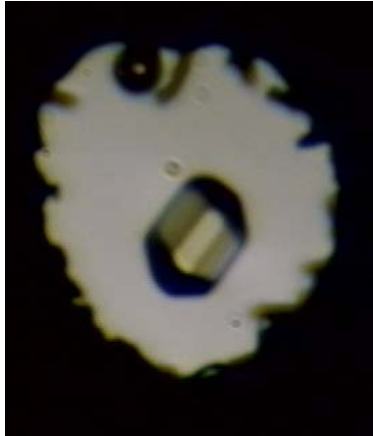
Fig 1: Coexistence of single crystal of (\text{N}_2)_{11}\text{He} with rich fluid He – 300 K; 11.5 GPa