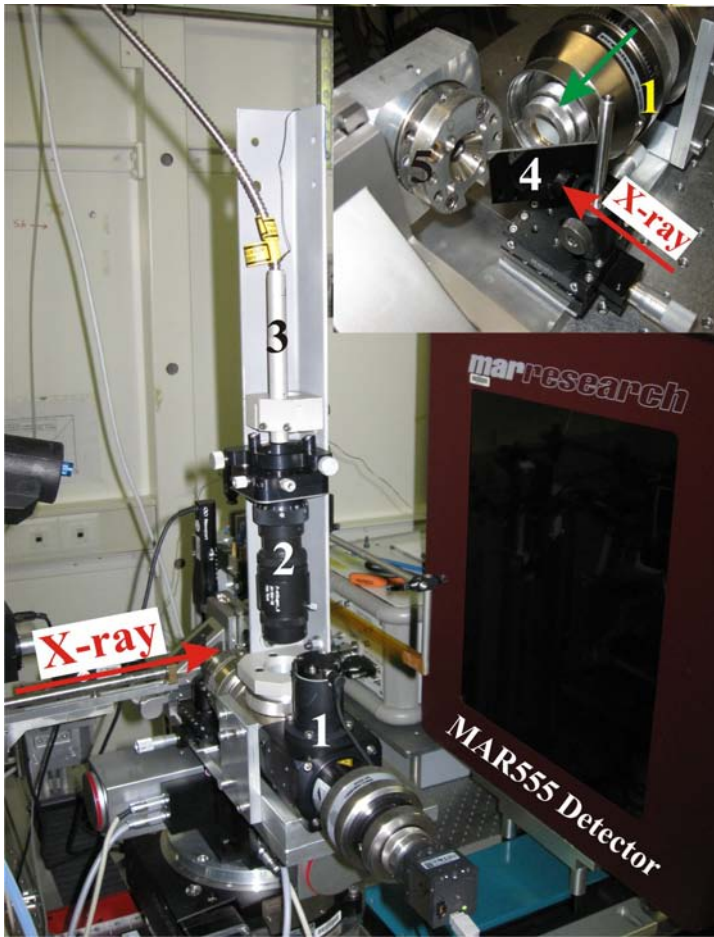
Fig. 1. Universal laser-heating head (UniHead) (1) with a \pi -shaper (2) mounted for single crystal X-ray diffraction experiments in diamond anvil cell at ID09a beam-line at ESRF (Grenoble). (3) – the optical fiber connected to the 100 W laser light source, (4) – the silver-coated carbon mirror, (5) – the diamond anvil cell; green arrow in inset shows the direction of the laser beam.