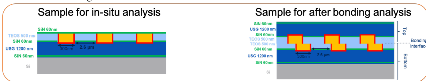
Figure 1 : Example of analyzed structures for 300nm pads in width.

Simple square and periodic Cu pads structures (see Fig. 1) have been prepared at STMicroelectronics in different states: 1) before bonding and 2) after bonding with a 400°C anneal. Four different pad sizes have been investigated: 300 nm, 1 μm, 2 μm and 3 μm. We have also investigated the influence of Cu thickness (between 750 and 2700 nm). In total 10 samples have been analyzed ex situ and 2 samples have been followed in situ during heat treatment.